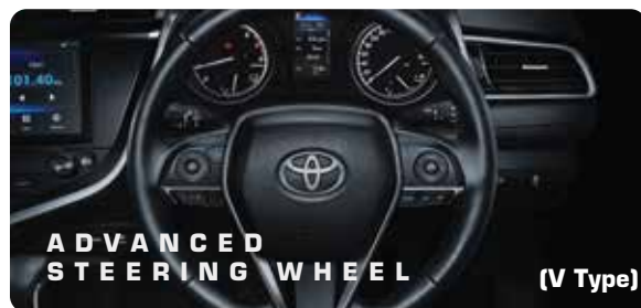
ADVANCED STEERING WHEEL