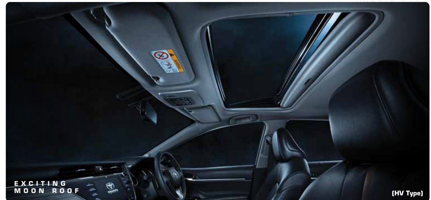
EXCITING MOON ROOF

Ensure your safety with Rear Cross Traffic-Alert that will keep you alert to vehicles approaching from each side when reversing and let the Blind Spot Monitor alert you to vehicles in blind spots using radar technology.