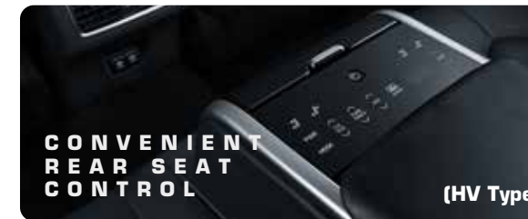
CONVENIENT REAR SEAT CONTROL