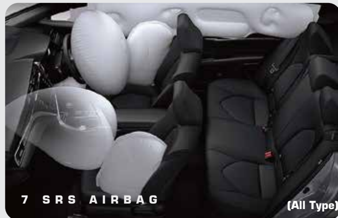
7 SRS AIRBAG

The seven airbags technology will keep all the passengers safe, reducing impact in the case of collision and giving each individual a comfortable ride in maximum safety.