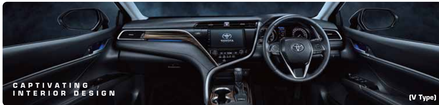
CAPTIVATING INTERIOR DESIGN