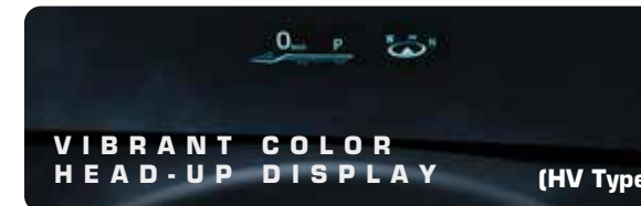
VIBRANT COLOR HEAD-UP DISPLAY